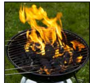
Charcoal barbecue grill