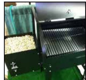
Wood pellet grill