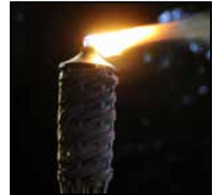
Liquid fueled Tiki