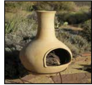
Portable fireplace (chiminea)