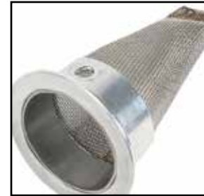
Spark arresting device