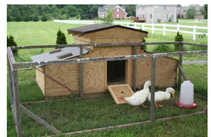
Example duck enclosure