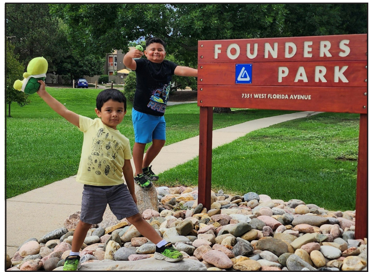
We love when playgrounds have green spaces next to them!

Let's come together to shine a spotlight on what makes Lakewood truly special—YOU! We can't wait to see and hear what you love about our community.