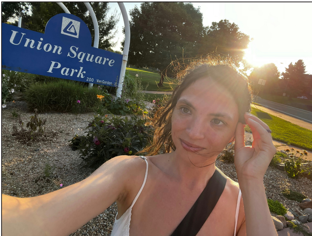
It's so nice to be able to walk to a park from home!