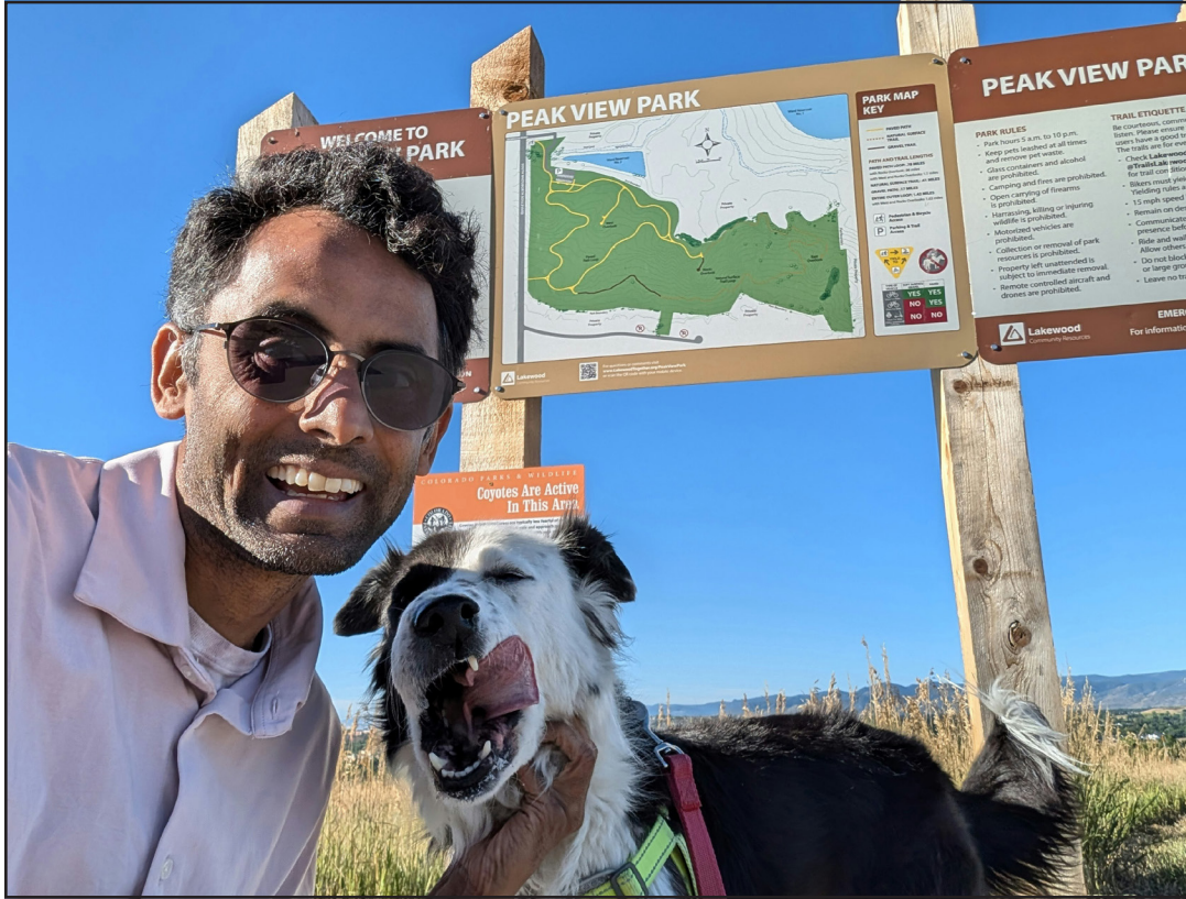
My new fav park. I love the view of the mountains from the park and easy access to this newest park.

More than 140 photos have been submitted for the MAYOR'S PARK CHALLENGE , which is a call that Mayor Wendi Strom put out to residents to visit Lakewood parks they haven't been to (and there's 114 of them) and snap a selfie to post on LakewoodTogether.org/MayorsParkChallenge . Photos posted by Sept. 30 are entered in a drawing to win a dinner for two at Casa Bonita. Feel free to visit the page to like your favorite photos too!