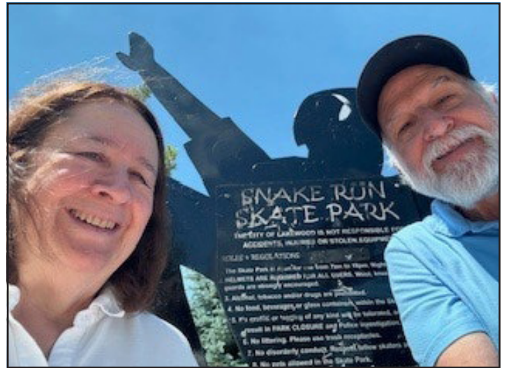
Wonder if we can see a future Olympian perfecting skills.