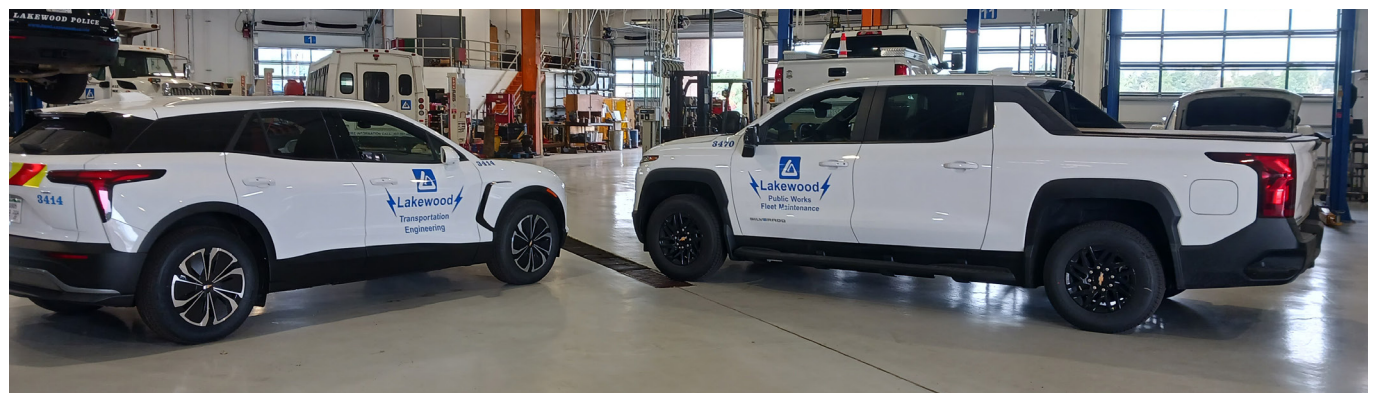
City fleet going electric. These are two of the six electric vehicles in the city's fleet, which are supported by new charging stations for city vehicles at the Civic Center. Xcel Energy-owned fast-charging stations for the public will be coming to the Civic Center later this year, and the city is working to add stations at its recreation centers.