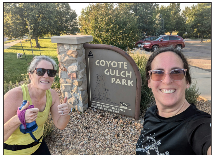
What a great expansive park with so much to do and views to boot.