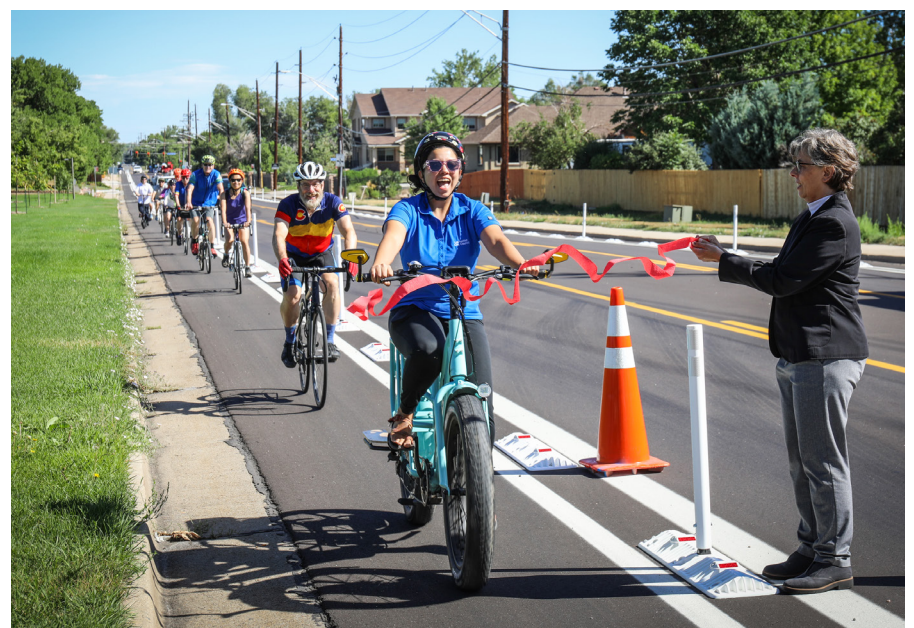
Lakewood celebrates its first separated bike lanes.

Twenty-five percent of greenhouse gas emissions in Colorado come from transportation, and 75 percent of people are driving alone in the metro area, with 45 percent of those trips lasting less than three miles, based on data from local